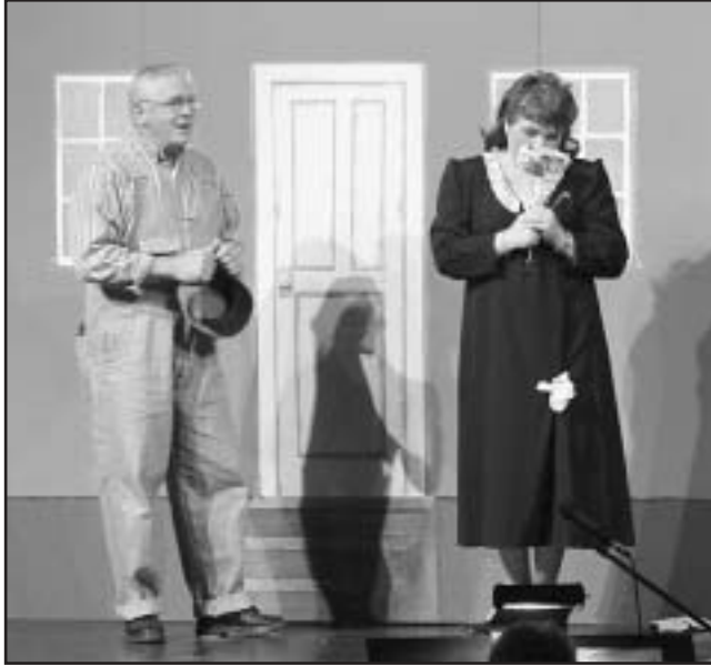
A Saskatchewan farmer "courting" a young school teacher