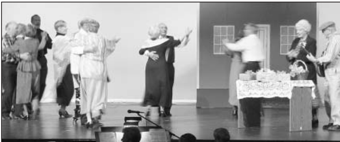
The school house became the site of a box social on many a Friday night- good for fellowship and fund-raising