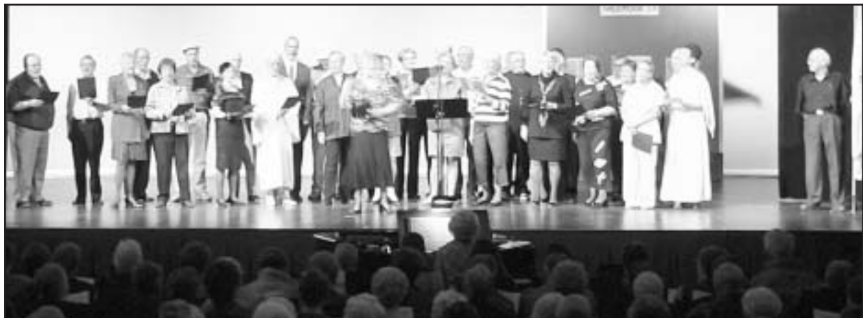
The entire cast and crew singing the "Centennial Song"

Additional photo can be viewed at: www.geocities.com/joebess2001/2006/stslittleredschoolhouse.html