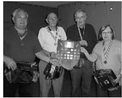
Tournament team 1st place.