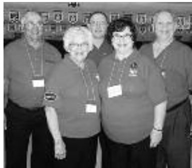
Home Team 1st place (Saskatoon).