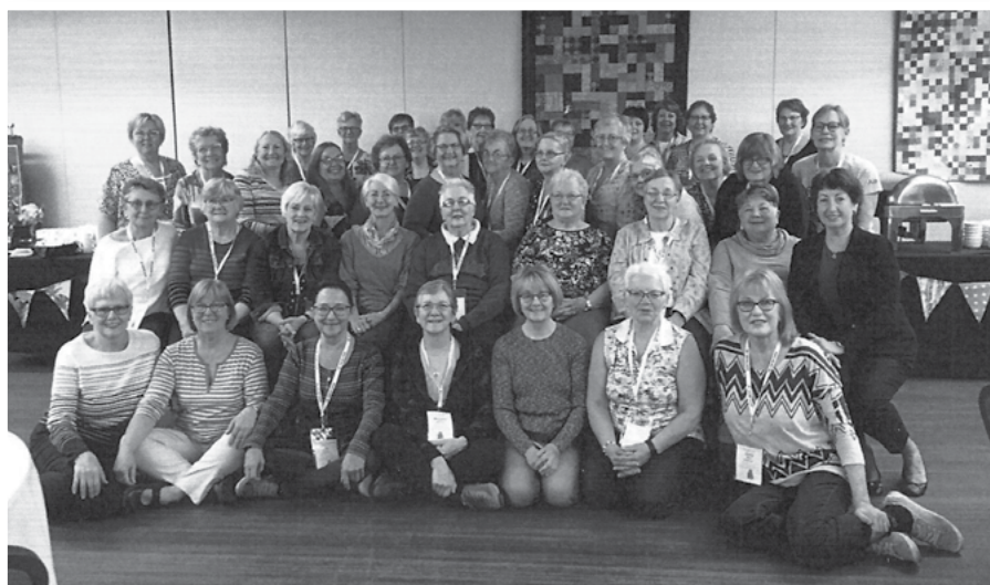
What a great looking group of quilters and sewers! Long time friends, along with new friends made, gathering for a group photo.